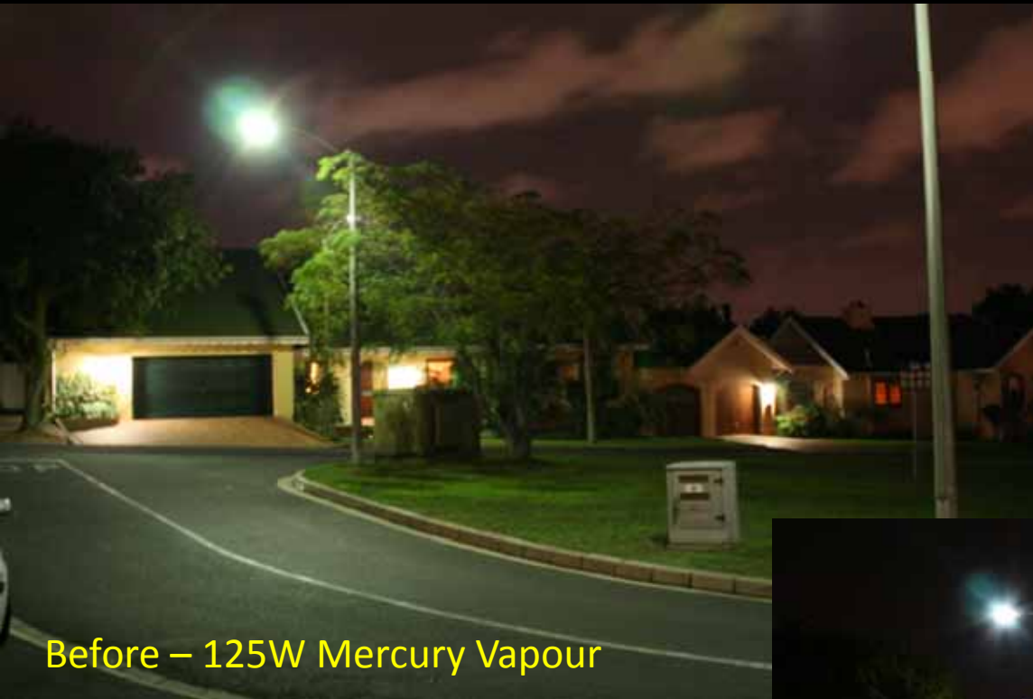
Before – 125W Mercury Vapour