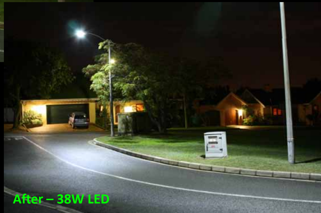
After – 38W LED